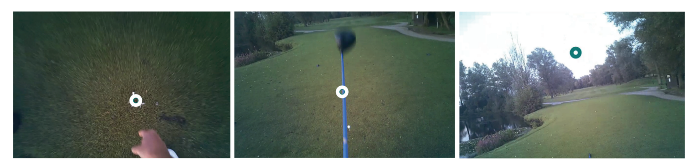
Figure 1: Point of gaze (circular cursor) at three moments during a golf shot. The function of fixation may be quite different when picking up a tee (left), lining up before a shot (middle) and tracking the ball after the shot (right).

The variation in gaze during sports is no surprise if one looks at the literature from natural behaviour. The key insight from these experiments is that gaze is highly specific to a particular task and sub-task (Foulsham, 2015; Land & Hayhoe, 2001). For example, during Land's tea-making experiments, some fixations were associated with guiding the hand when reaching; others with manipulating items (e.g., putting the lid on the kettle); and others with monitoring a state of the environment (e.g., waiting for the kettle to fill). That participants can seamlessly switch between the appropriate types of gaze behaviour demonstrates a high level of learned control. Such control, and exquisite timing, must also be hallmarks of the trained athlete. The examples from natural behaviour teach us that it is only possible to fully interpret the function of gaze patterns, and measures like fixation duration, within a more detailed description of the task and the motor acts involved. Expertise and extended processing are normally associated with shorter fixations in laboratory tasks, where stimuli and processing difficulty can be controlled, and it is easier to draw conclusions about a single fixation. In sport, walking and tea making, longer gazes are often associated with the monitoring of dynamic information in the environment, as well as with over-learned, predic-